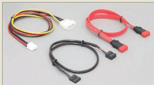
eSATApd (Power Over eSATA Dual)