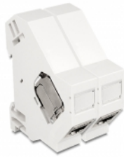
Anwendungsbeispiel mit Stecker