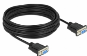
mini Sub-D 9