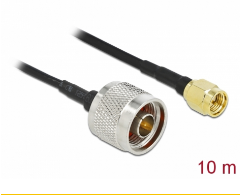
Item no. 90468

The antenna cable by Delock is suitable for connecting components of radio frequency technology.